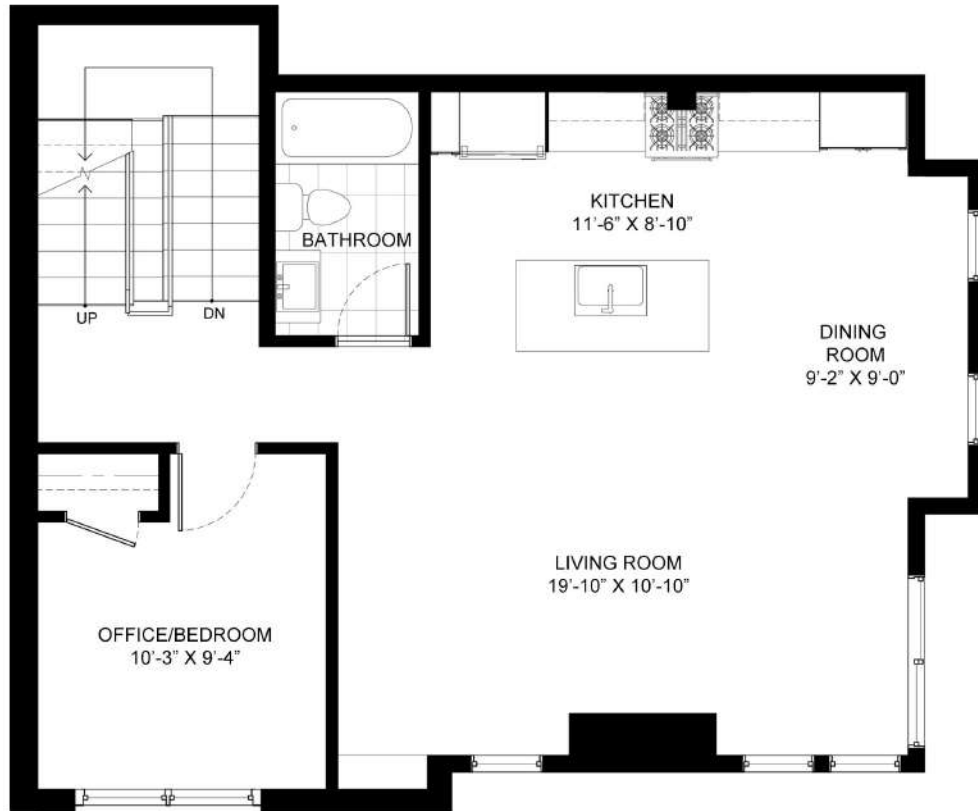
SECOND FLOOR PLAN - UNIT B