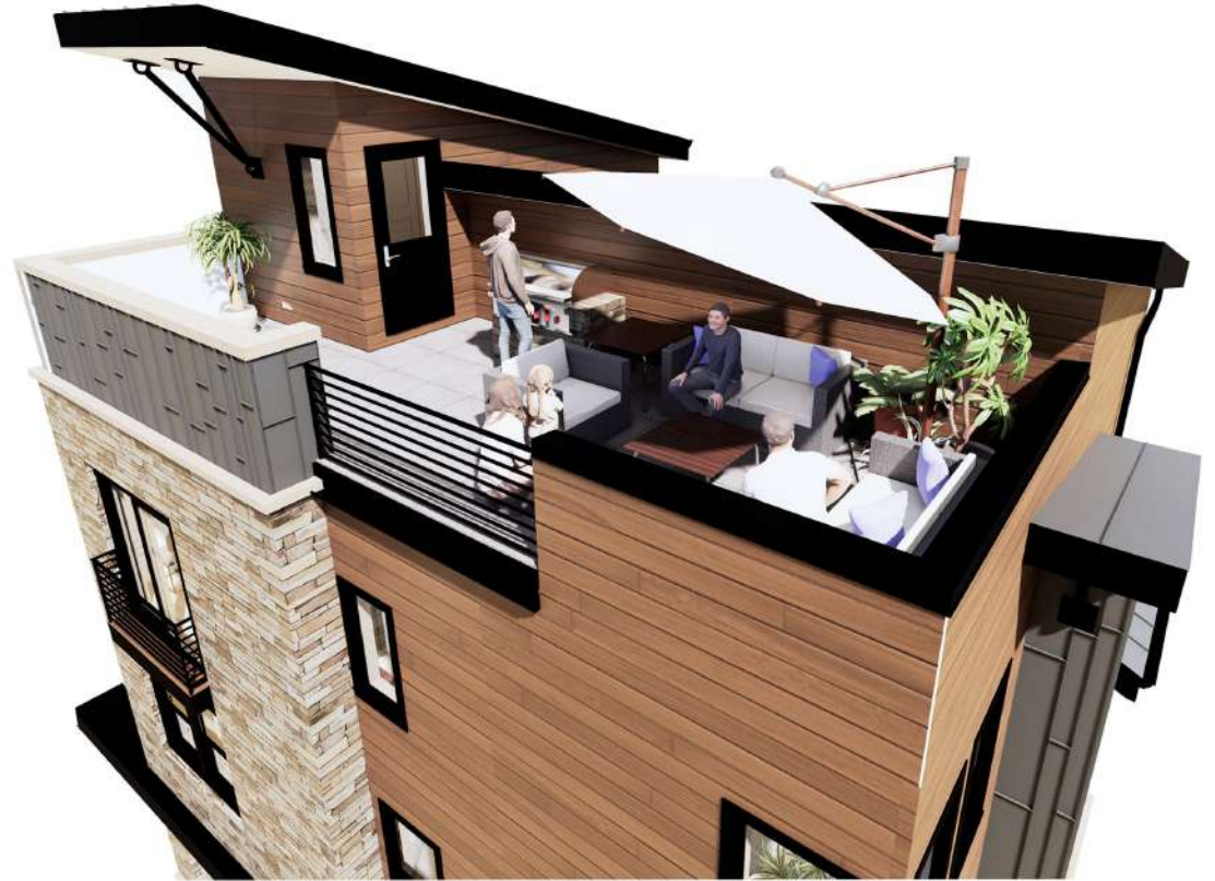
ROOF DECK PERSPECTIVE - UNIT B