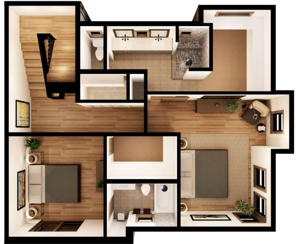
THIRD FLOOR PERSPECTIVE - UNIT B