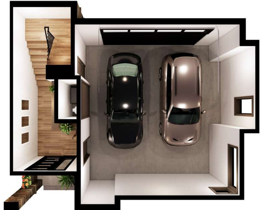
FIRST FLOOR PERSPECTIVE - UNIT B