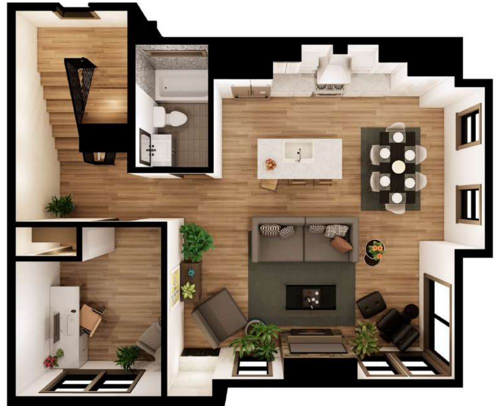
SECOND FLOOR PERSPECTIVE - UNIT B