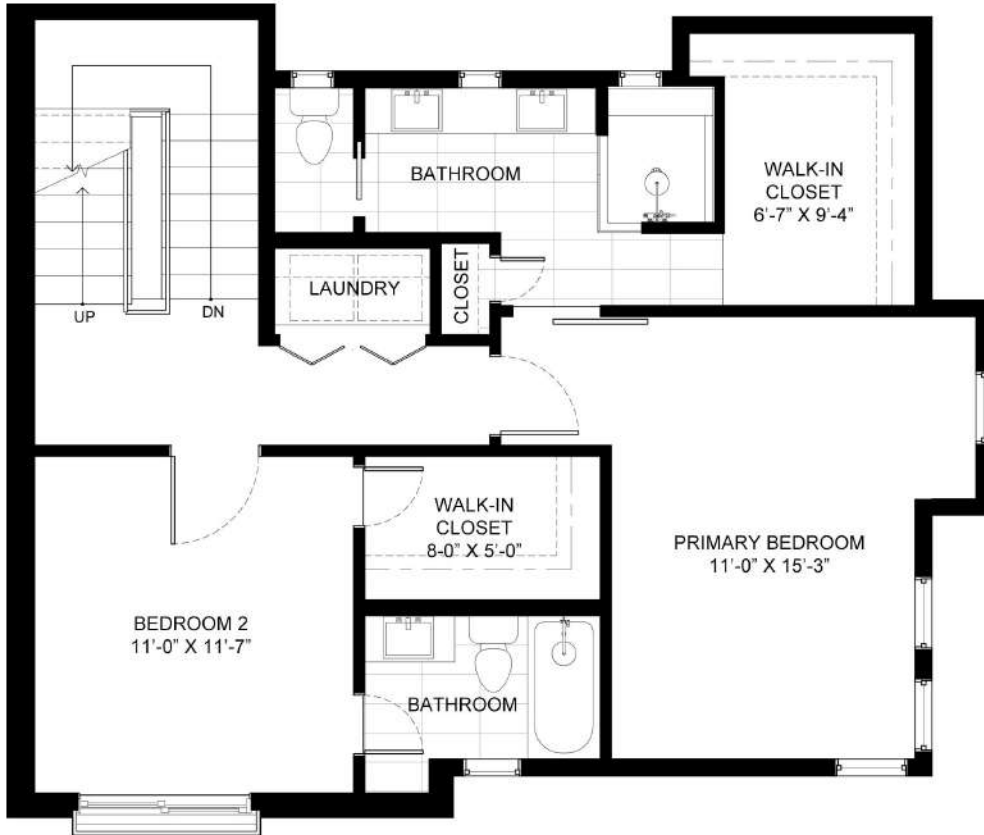
THIRD FLOOR PLAN - UNIT B